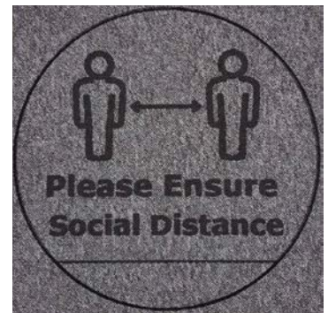
5312 CREATE SD