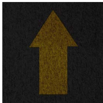
5350 CREATE SD

Ideal concept for both facilities managers and office managers to replace existing tiles, or as a virus prevention initiative on new flooring projects.