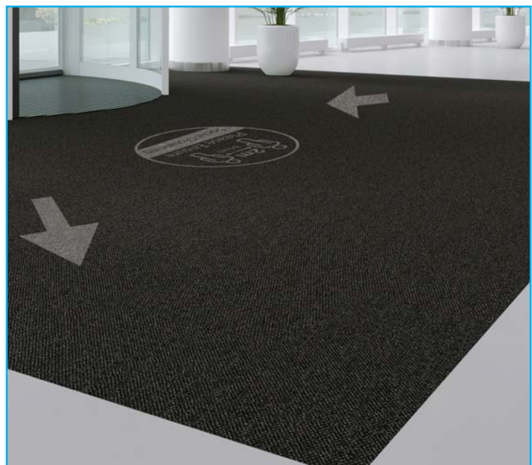
Illustration of use only

Use CREATE SD directional arrows, Social Distancing Entrance Mats and CREATE SD safe distance tiles to really make sure that employees and visitors have a clear indication of how to safely navigate a workplace.