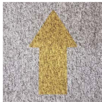
5330 CREATE SD