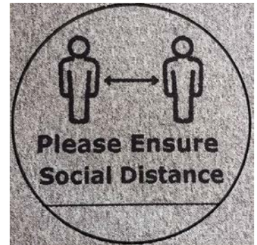
5322 CREATE SD